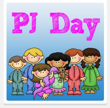
PJ Day Monday, December 19th and Tuesday, December 20th.